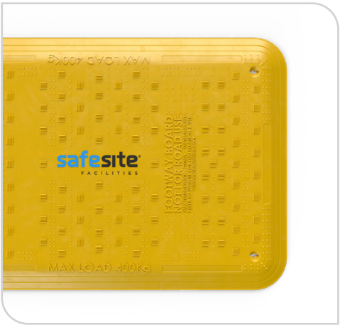
High impact resistance & Anti-Slip